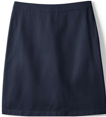
Girls Skort or Navy shorts with cuff